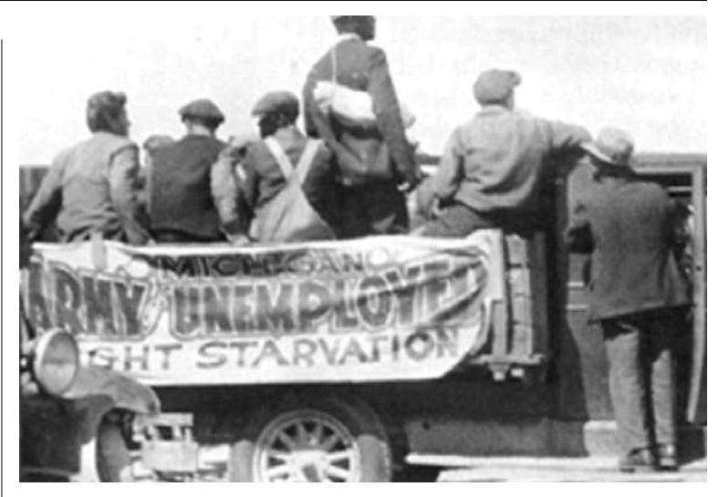
UNEMPLOYMENT SKYROCKETED after Congress raised tariffs and taxes in the early 1930s and stayed high as policies of the Roosevelt administration discouraged investment and recovery during the rest of the decade.

Substantial cuts in high marginal income tax rates in the Coolidge years certainly helped the economy and may have ameliorated the price effect of Fed policy. Tax reductions spurred investment and real economic growth, which in turn yielded a burst of technological advancement and entrepreneurial discoveries of cheaper ways to produce goods. This explosion in productivity undoubtedly helped to keep