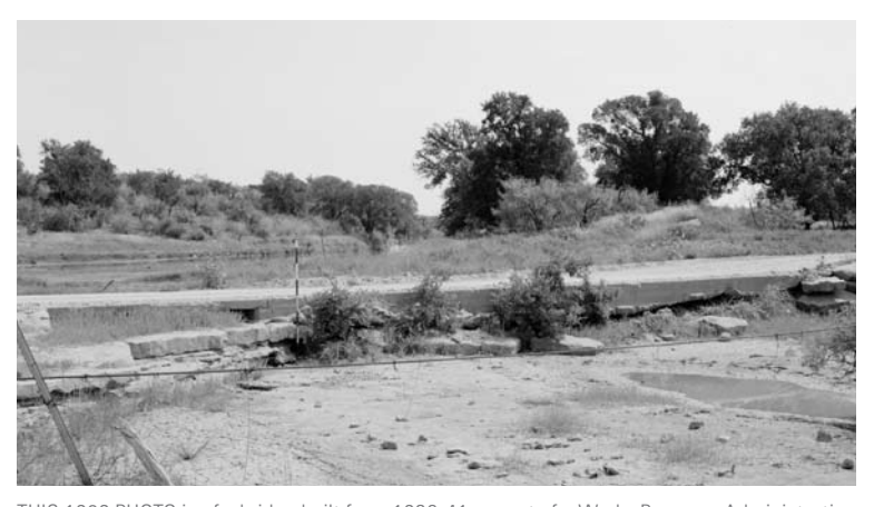
THIS 1989 PHOTO is of a bridge built from 1936-41 as part of a Works Progress Administration (WPA) project in Coleman County, Texas. Many Americans saw such projects as helpful, without considering their high cost and the corruption that plagued the program.

Crisis gripped the banking system when the new president assumed office on March 4, 1933. Roosevelt's action to close the banks and declare a nationwide