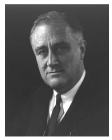
AMERICANS VOTED for Franklin Roosevelt in 1932 expecting him to adhere to the Democratic Party platform, which called for less government spending and regulation.

Officials in the administration and in Congress believed that raising trade barriers would force Americans to buy more goods made at home, which would