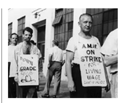
SPECIAL POWERS GRANTED to organized labor with the passage of the Wagner Act contributed to a wave of militant strikes and a "depression within a depression" in 1937.

Mencken excelled himself in attacking the triumphant FDR, whose whiff of fraudulent collectivism filled him with genuine disgust. He was the 'Fuhrer,' the 'Quack,' surrounded by 'an astonishing rabble of impudent nobodies,'