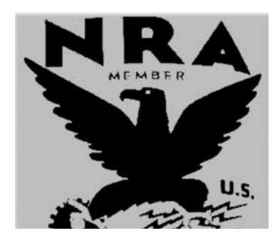
TO MANY AMERICANS, the National Recovery Administration's bureaucracy and mindnumbing regulations became known as the "National Run Around."

Franklin Delano Roosevelt won the 1932 presidential election in a landslide, collecting 472 electoral votes to just 59 for the incumbent Herbert Hoover. The platform of the Democratic Party, whose ticket Roosevelt headed, declared, "We believe that a party platform is a covenant with the people to be faithfully kept by the party entrusted with power." It called for a 25 percent reduction in federal spending, a balanced federal